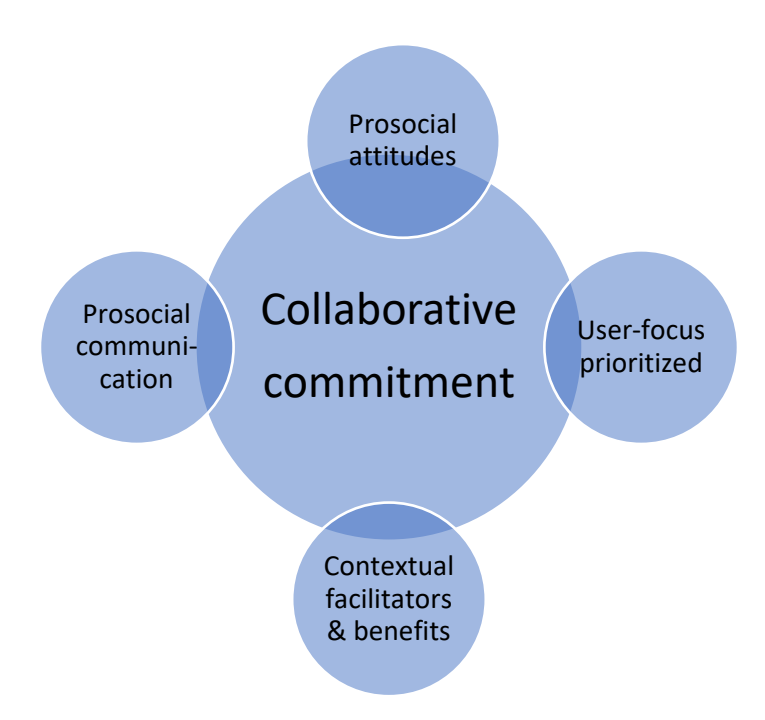
Figure 2 A theoretical model of collaborative commitment, based on the findings of the study (made by author)

How the four factors interact the informants do not explain. Nor do they say anything about whether one factor is developed first, or whether the factors emerge in a parallel way? One can imagine that there are double pointing arrows between all the four small circles, signalizing that they are mutually working together to create collaborative commitment (the big central circle).