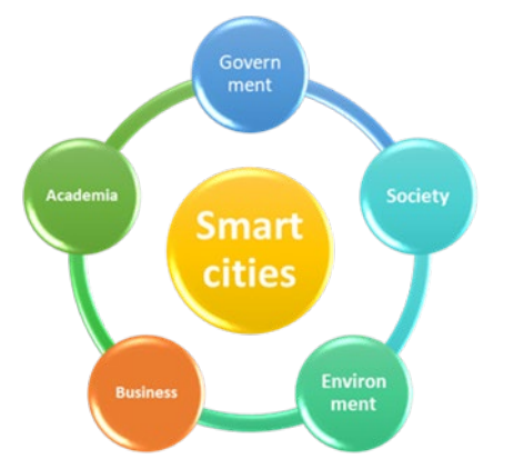
Fig. 2. Quintuple helix model, applied to smart cities.

By complementing traditional education with elearning, the use of learning management systems and elearning platforms have become the standard for educational institutions, especially in higher education [17]. Although the pandemic situation is now a part of our past, improved e-learning practices in the learning process are undergoing further development and e-learning has entered its next, more mature stage [18]. The introduction of artificial intelligence (AI), augmented reality (AR) and virtual reality (VR) in education will become compulsory in the near future. Smart learning is related to the use of modern technologies for teaching and evaluating the