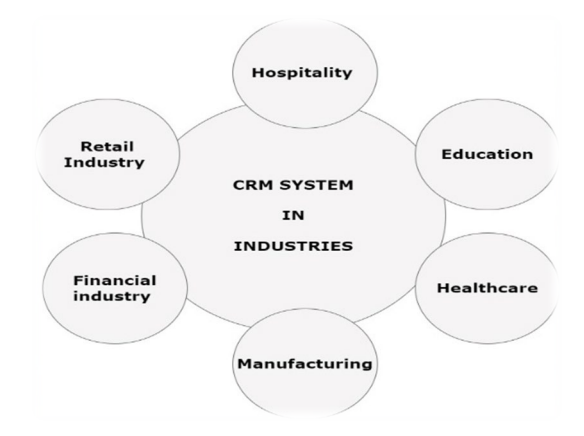
Fig. 3. Industries using CRM systems.

Every business has its own specifications and every owner runs their business differently. As a result, there are many different ways to develop the perfect CRM system [13]. Some of the industries using CRM systems are: