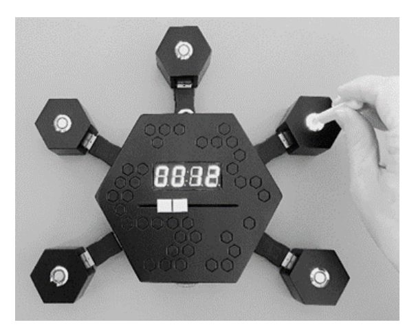
Fig. 2. Participant performs a task by pressing the small 0.5 cm buttons on the SnipTouch device prototype with a dowel.