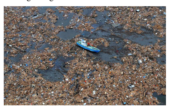
Fig. 5. Island of plastic [13]

Plastic doesn't just mean uglier beaches, even in untouched places. Marine animals can become entangled in larger floating pieces or become confused and swallow smaller particles. Plastic also attracts toxic substances that end up in the fish's digestive system. From there, along the food chain, it can also reach humans [9]. The effect on human health is unknown at least for now, but it is certain that the damage is significant.