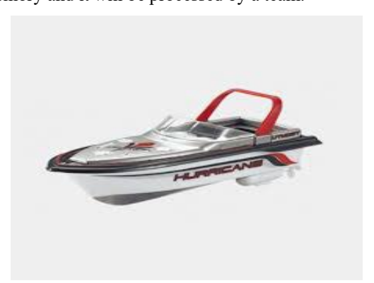
Fig. 3. Prototype of a device for transmitting information

The goal of the project, which was generated in the gatherings of the "Curious" club at Vasil Levski National Military University, is to make a prototype of a floating device that can move autonomously along the river bed and photograph and study the terrain of the river bed and the surrounding area for the presence of waste and channels that drain into the river. The device will record and transmit information to a central point. The information will be collected and a characterization of the riverbeds along the entire length will be made, based on the collected information, maps of the rivers, landfills and waste pipes will be made. This information will be very valuable because the government authorities do not know or care about such dumps and there are many waste canals built and discharged that are not regulated, legal and do not have basic treatment facilities. The device will be small in size, which will allow it to pass in small streams, and an all-terrain function can also be offered to be able to pass through fords and when the water level drops. There will also be navigation to manage and location tracking for on-demand detection and theft prevention. At the same time, it will store and transmit information about the status of the areas it has checked. After completing his mission, an operator will download the collected information from his memory and it will be processed by a team.