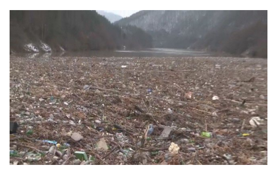
Fig.1. Waste along the river Iskar, 02.2021

In turn, water bodies are divided into land water bodies on the one hand and seas and oceans on the other. Therefore, we divided our project conditionally into two parts - in the first part we will examine the waste in the streams, rivers, lakes and swamps on the continental part of the Earth, and in the second part we will pay attention to the pollution of the world's oceans. In both parts, there are many human-contaminated sites, but each has its own specifics for monitoring, mapping and taking measures to reduce the existing waste [2], [9]. Each contamination can also have its own specifics for its tracking and subsequent removal. It can be said that the same river that flows through different countries has different characteristics of the terrain through which it flows and the degree of pollution both of the river itself and of the nearby land areas. There are enterprises that dump their waste at night, when the controlling authorities are not working, and therefore one of the directions to limit pollution is the use of sensors and cameras that work in a continuous mode and can be traced back in time when, who and how caused the pollution of water bodies and the coast or dumped unregulated hazardous waste. During the last floods in September 2023 along the Southern Black Sea coast of Bulgaria, many discharges of waste water were seen near the coast, no larger than 20 meters. The development is also in this direction.