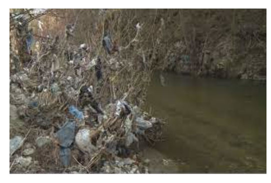
Fig. 2. Drops on the branches of the bushes along the banks of the Mesta River

And this was not an isolated case. Instead of taking preventive measures, clean up the pollution and continue in the same way until the next big pollution is caused and there will still be no one to blame.