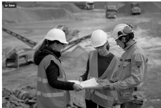
Fig. 2. New T-shaped engineers on site.

Well-trained employees can be a true value driver for the company because their skills and knowledge can have a significant impact on a company's performance relatively quickly. Well trained T-shaped engineers may help deliver on the company's production targets and strategic objectives faster. There can also be an increase in de-siloing and a positive change in the working environment and company culture.