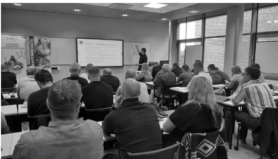
Fig. 3. Occupational Qualification for company employees.

The professional standards outline the skills and knowledge that an engineer has acquired. An occupational qualification standard is a document describing the relevant occupational activity and competence necessary for practicing an occupation, i.e., skills, knowledge, and attitudes necessary to work successfully. The skills can be soft skills (mainly cross-discipline expertise) and hard skills (skills that you need at your occupational level in the sector). Occupational Qualification is given out when the competence for the profession meets the competence requirements set out in the professional standards.