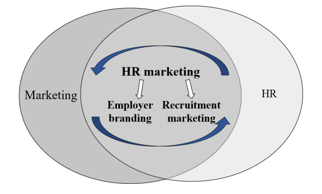
Figure 1. HR marketing components.

recruitment marketing definition analysis by Alashmawy, it is used in the pre-applicant phase to