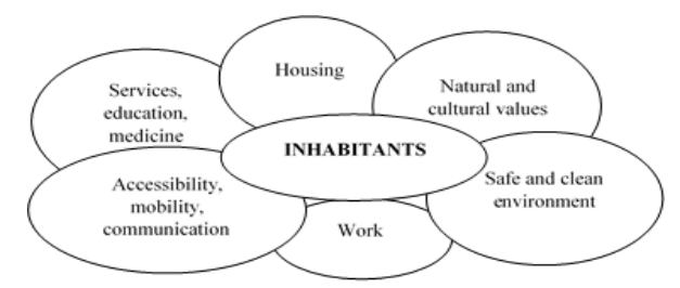
Fig. 2. Relationship and Interaction of Framework Conditions.

Municipalities compete to attract people to the region, so they use various marketing methods - develop the brand of the place, organize events and compete for large-scale cultural events, improve the environment. The author acknowledges that the most important factors for the population as a target audience are the place to live and work. Factors that rank differently for each person are highquality social services, leisure opportunities, a clean and safe environment, and convenient transport infrastructure. The long-term development strategies of Cesis, Valmiera and Smiltene districts will be further analysed, determining whether or not the use of local marketing is used in this planning document.