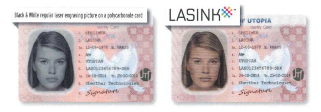
Fig.3 Black and white picture polycarbonate document (Unpublished materials of the State Border Guard.)

Laser engraving is always black and white, as the data is laser embedded in one of the polycarbonate layers. Tactile The peculiarity of laser engraving is that it differs from laser engraving - letters or numbers can be touched and explored in the side light, as a relief effect is created. Laser engraving is also used on the polycycarbonate document to create a color image, but on a preprinted line matrix (Unpublished materials of the State Border Guard).