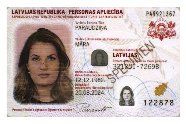
Fig.1 Identity card of the Republic of Latvia (Document sample library of the State Border Guard (DokAB ))

We will also touch on some of the more innovative personalization methods. In the standard, most often - in polymer documents one method of personalization is used - laser engraving method. When modifying their national documents, so-called combined methods have also emerged, where a single document can contain up to three different personalization methods or variants. For example, the identity card of the Republic of Latvia for modification in 2019 or 2021 - polycarbonate material, with its own protection elements, safe dyes, personalization and production methods.