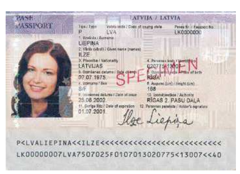
Fig.9 Inkjet printing on paper documents