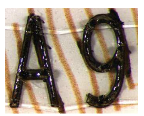
Fig.2 Laser engraving and tactile laser engraving (Document sample library of the State Border Guard (DokAB ))

Laser engraving is always black and white, as the data is laser embedded in one of the polycarbonate layers. Tactile The peculiarity of laser engraving is that it differs from laser engraving - letters or numbers can be touched and explored in the side light, as a relief effect is created. Laser engraving is also used on the polycycarbonate document to create a color image, but on a preprinted line matrix (Unpublished materials of the State Border Guard).