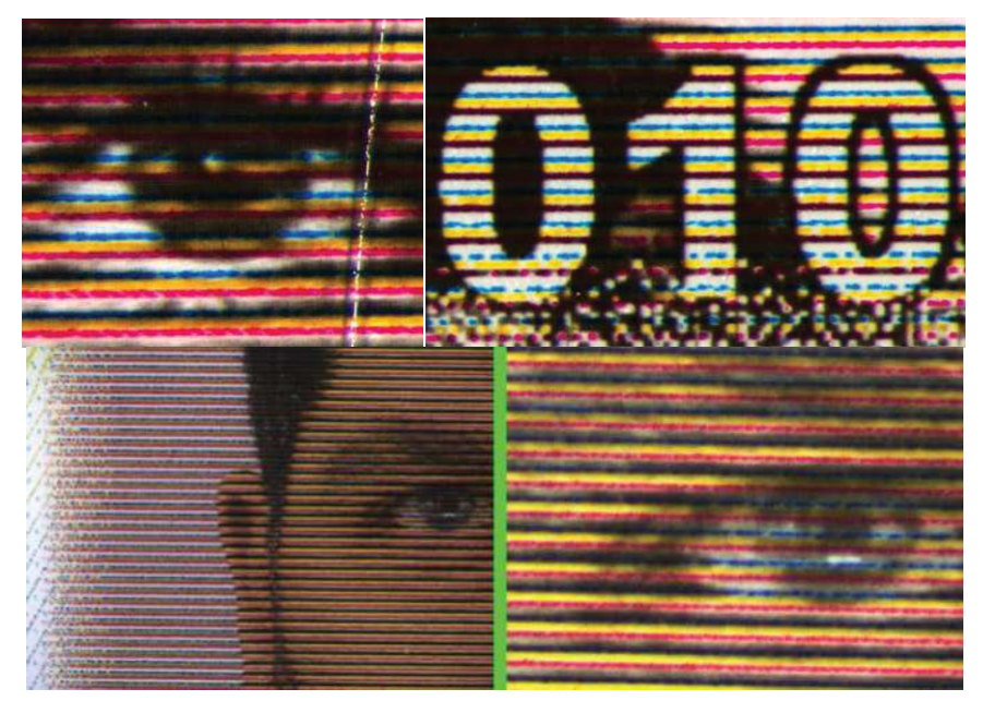
Fig.4 Zoomed image in "LASINK" technology

The irreversible personalization of color images inside polycarbonate credential substrates is a challenge. With standard printing techniques, the color photo needs to be protected by an overlay or a varnish, resulting in compromised document integrity as well as loss of tactile features. Printing the color photo in one of the polycarbonate layers before the lamination step during manufacturing is a secure solution. However, it makes the issuance process inflexible. The now secure and flexible technique is the use of a laser that engraves a photo with gray tones into the polycarbonate. To be this limits personalization to black and white pictures (Idemia, 2022).