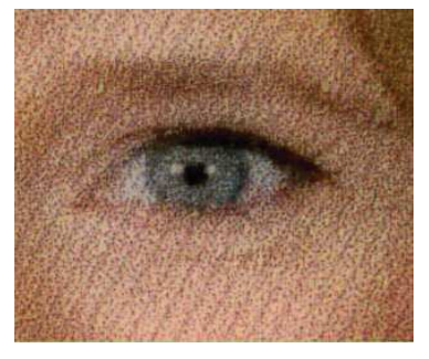
Fig.6 Research of personalization methods with first line equipment

The second line of document inspection uses in-depth inspection equipment, which is used for in-depth inspection of personal and vehicle documents presented at the border crossing point, as well as other legal documents, in order to confirm and visualize the signs of forgery detected in the primary inspection.