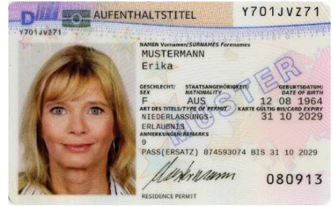
Fig.8 Polymer-adapted inkjet printing on polymer documents

The photograph is printed on an internal layer using an inkjet printing method. The ink consists of polycarbonate particles. After the fusion of the different layers, the polycarbonate ink will diffuse through the different layers. Under magnification the individual ink droplets look elongated.