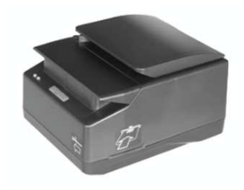
Fig.5 First line equipment

The standard magnification - both inkjet and polymer-adapted inkjet - can be recognized by standard features - chaotically scattered dots.