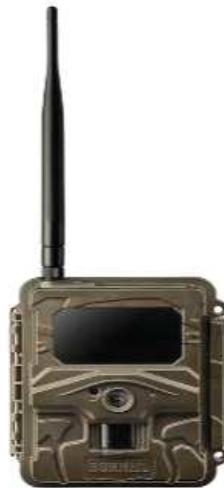
Fig. 3 Presence detection system BURREL components (compiled by the authors)

Photosensor can be controlled manually - in person or remotely via SMS commands. During the manual test, the operator uses the sensor control buttons and the built-in display to change the sensor configuration. Remote control of sensor operation takes place via SMS commands sent to the SIM card number of the respective photosensor. The SMS command is a code received by the photosensor and running according to a defined algorithm.