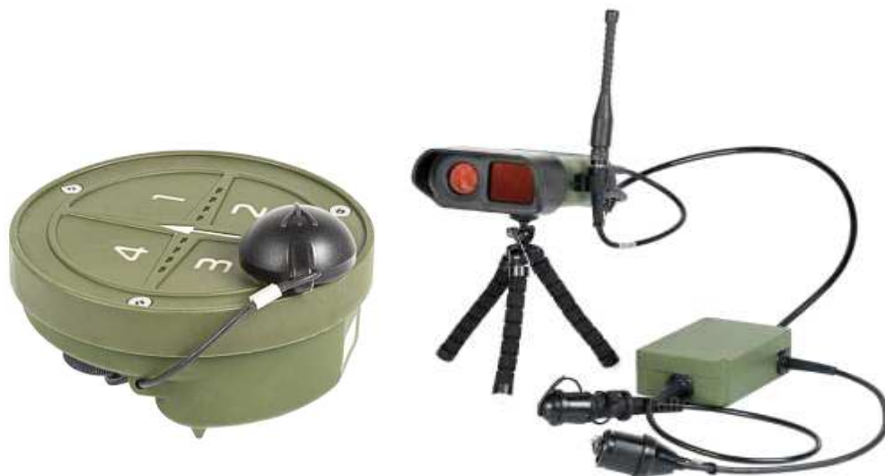
Fig.4 Components of the DEFENGUARD presence detection system (compiled by the authors)