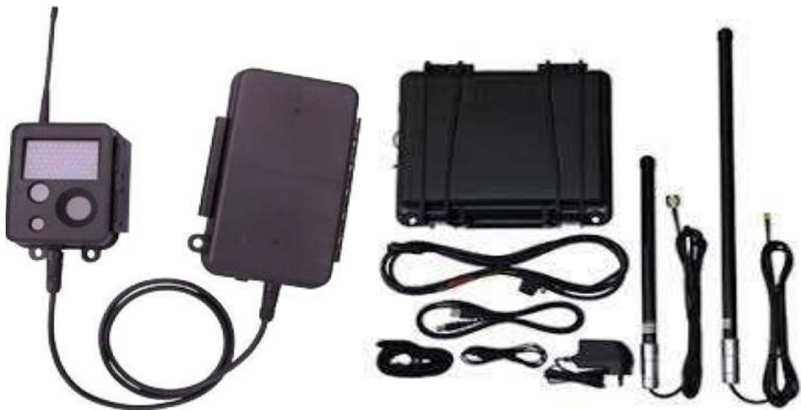
Fig.2 Components of the BUCKEYE presence detection system (compiled by the authors)