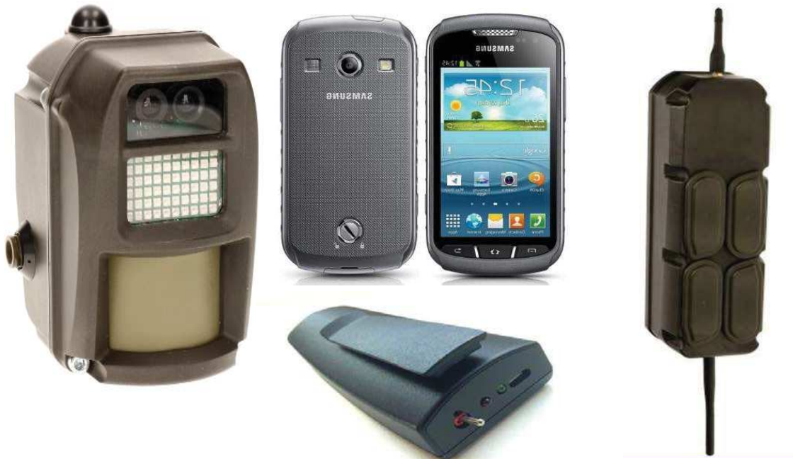
Fig.1 Components of the SMARTDEC presence detection system (compiled by the authors)