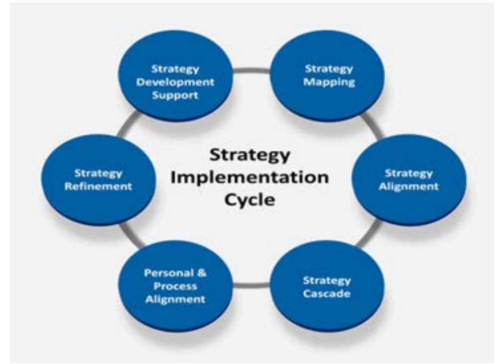
Figure 2. Strategy Implementation Diagram