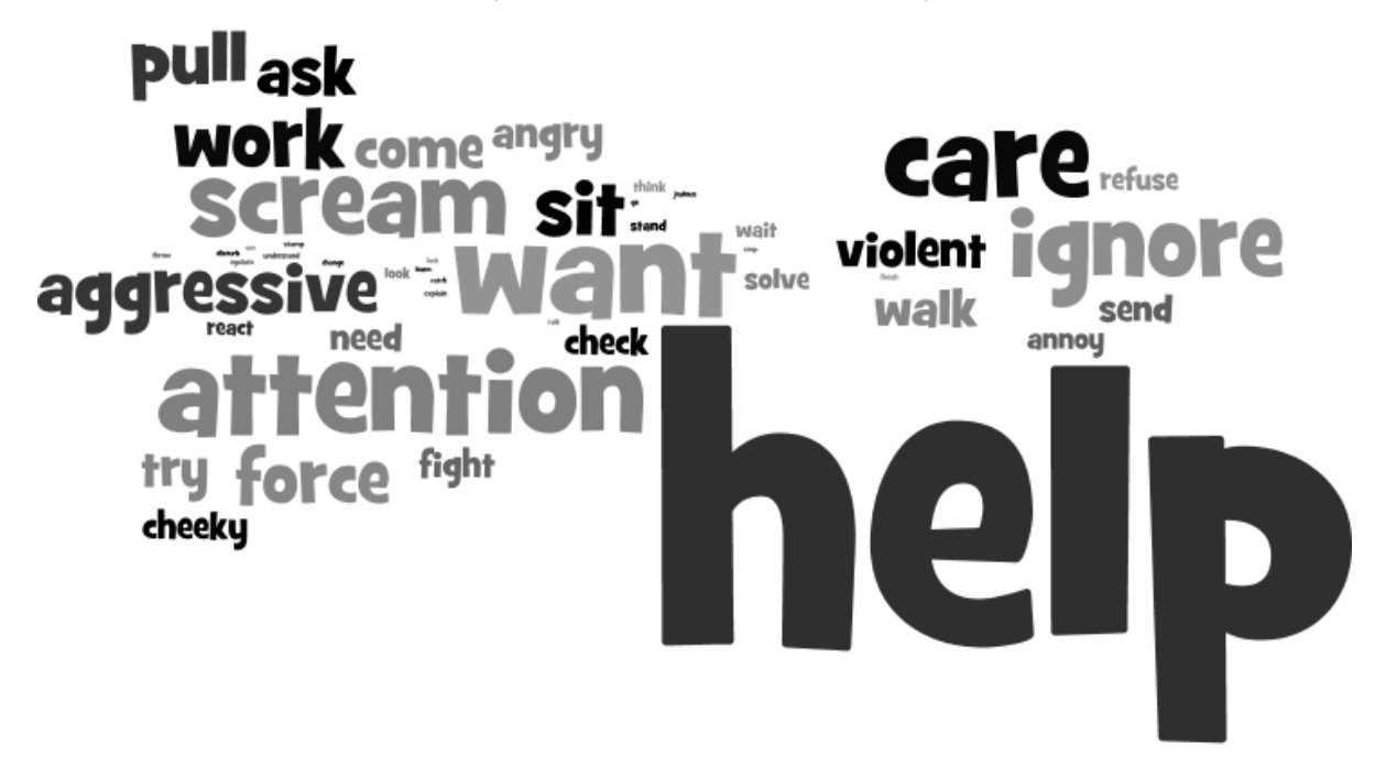
Fig. 2. Frequence of words used by junior student teachers

Junior student teachers focused on the child's need for help as a critical moment in the scene. The other frequently used words described that the teacher did not care or ignored the child, but the child still wanted teacher's attention . The most frequent adjectives used to describe the scene were aggressive , violent , cheeky and angry , describing the child's behaviour (Figure 2).