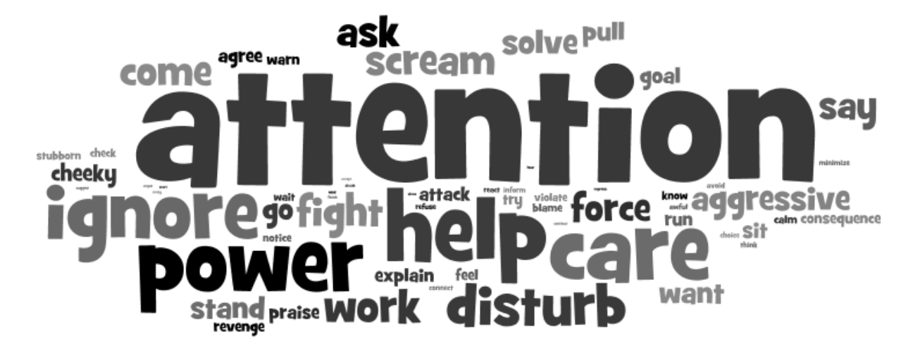
Fig. 3. Frequence of words used by senior student teachers

care). The adjectives used to comment on the behaviour, or the situation (aggressive or cheeky) were less frequent than in a junior group. Senior student teachers used in their comments terminology of adlerian psychology classroom management (attention, power, goal, consequence, or revenge). These are examples of student teachers' tendency to connect the observed phenomena with the previously acquired knowledge (Figure 3).