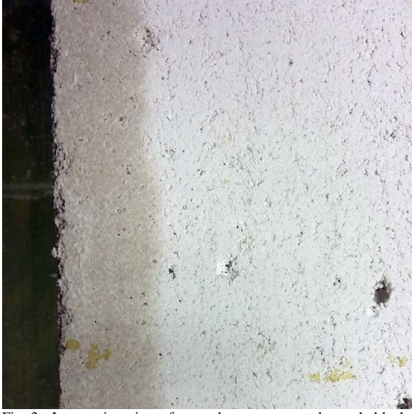
Fig. 3. Intersection view of aerated concrete wetted sample block after dosage of 441 ml sprayed water during 23 min– the penetration of water into the deeper surface areas is visible up to \sim 4 cm.

The measurement setup consisted of standard gain horn antennas as presented in figure 4. The antennas were positioned in a manner to place the sample to the far field region (10 wavelengths) while the microwave was hitting the material.