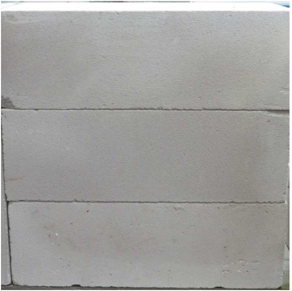
Fig. 1. One of the three aerated concrete sample walls constructed of three blocks.

microwave spectrum utilized for the that purpose. 2.4 GHz is also the frequency of the microwave oven, since it has good absorption characteristics within the water content in the food.