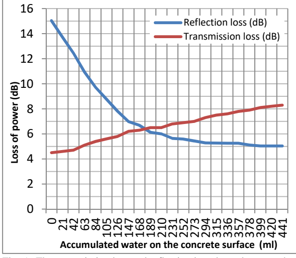
Fig. 5. The transmission loss and reflection loss dependency on the amount of accumulated sprayed water. Vertical bars also constitute of 1 min intervals.

The transmission loss and reflection loss dependency on the amount of accumulated sprayed water is shown on graph 5.