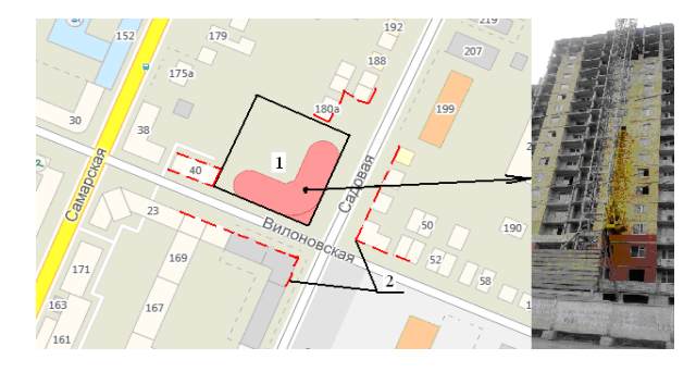
Fig. 1. The scheme of construction site №1: 1 – the construction site, 2 – borders of a residential area

As many as 12 construction sites have been examined [2-4]. All sites were located in close proximity to residential areas in the central part of the city. Figure 1 shows the scheme of one of the construction sites.