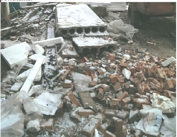
Figure 3. The view of the construction waste dump site (dump site 2)

One of the possible cases for the concrete and reinforced concrete waste use is using it during the construction and reconstruction of environmental and hydraulic structures [21-23]. Since such constructions usually involve temporary or permanent contacts with water bodies, the waste used in them must undergo a thorough pre-sorting and checking for harmful pollutants.