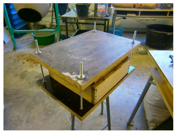
Fig. 1. Mould for compression

Third mould is filled with remaining material by filling in layers and tamping, a plywood plate is put on top, but no extra pressure is added. For the second part of the test only first two stages are used, as samples without any pressure showed poor results.